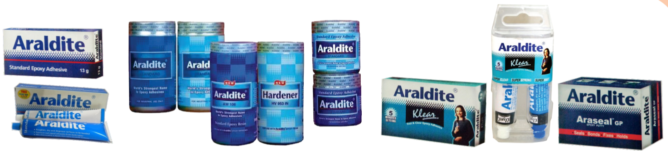
◆ Araldite Standard / Fast & Clear Epoxy Adhesive ◆ Araseal Epoxy Putty in GP/WHITE & ZAT-PAT