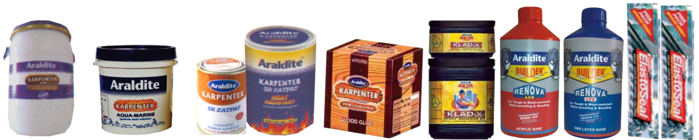
◆ Karpenter Synthetic Resin Adhesive in AQUA-MARINE and Synthetic Rubber Adhesive in HEAT RESISTANT ◆ BUILDER KLAD-X for Vertical Cladding of Marble & Granite ◆ BUILDER Range for All Leakage Solution in LTX & ACR