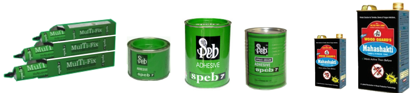
◆ Speb7 ADHESIVE FOR MULTIPURPOSE Bounding ◆ WOOD GUARD Anti Termite Tonic for Wooden