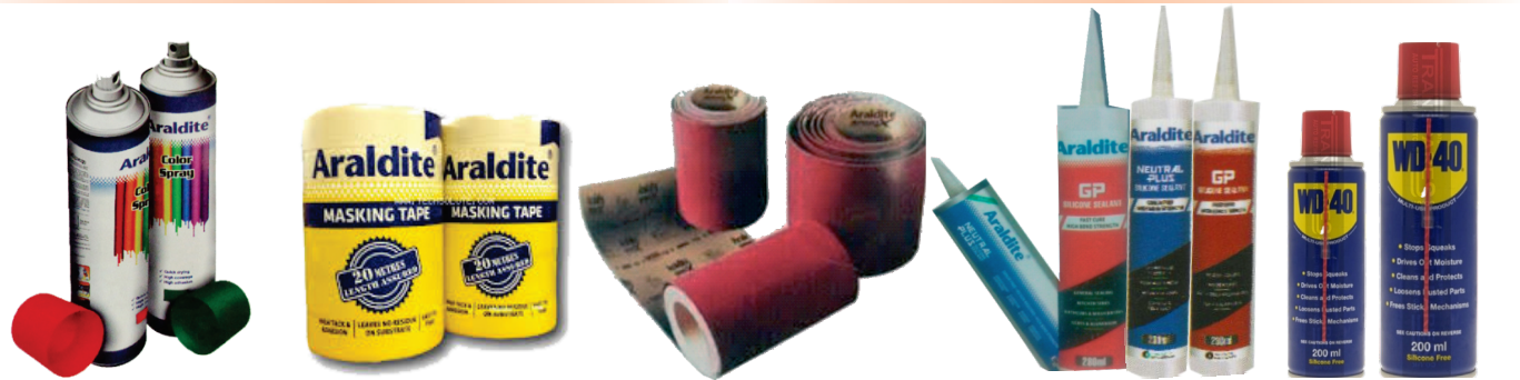
◆ Araldite Color Spray ◆ MASKING TAPE ◆ SAND X SAND PAPER ◆ SILICON SEALANT ◆ WD-40 Aerosol