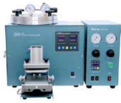
25.0208 Digital Wax Injector - Imported Model - With Auto Clamp System