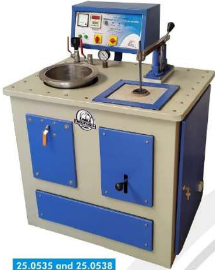
25.0535 and 25.0538