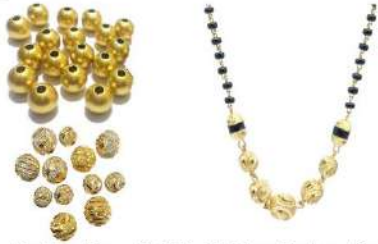
Hollow Para (Balls) Making Factory Setup