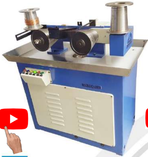
80.0332 12 Pass Wire Drawing Machine - With Dual Speed Motor (Optional Speed Controller AC Drive)