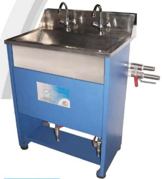
26.0601 to 26.0603