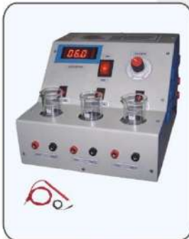
57.0202 Pen Plating Machine Premium Digital Model 25 ML. Glass Beaker