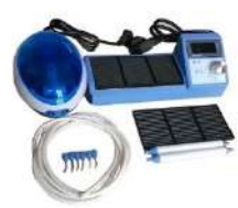
25.0271 Diamond Setting Machine on Wax Models