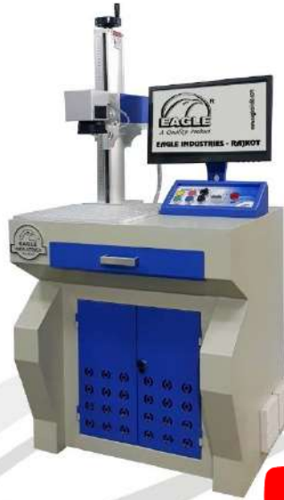
48.4302 to 48.4305 Eagle Laser Marking Machine - Available 20W, 30W, 50W, 100W Models - 50W and 100W can also do Laser Cutting Work