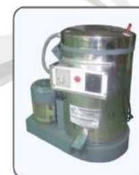
74.0401 to 74.0403 Drier Machine Stainless Steel Body 3-5-8 Kg Capacity Available