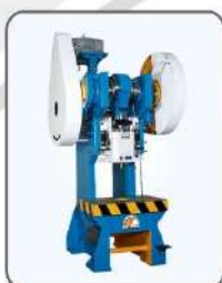
60.0431 to 60.0041 Electric Power Press Available Capacity 3 to 50 Ton