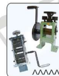
64.7101 To 64.7103 Corrugating Machine Two Roll & Four Roll Big & Small Extra Rolls Also Available