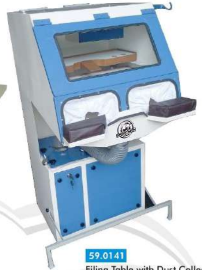
59.0141 Filing Table with Dust Collector