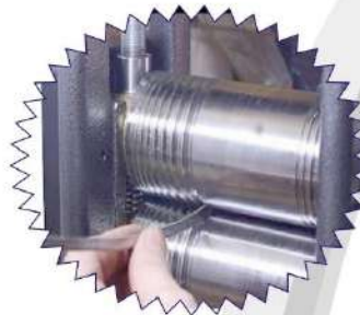
Optional Round Wire Drawing Attachment available for all Double Head Electric Rolling Mills