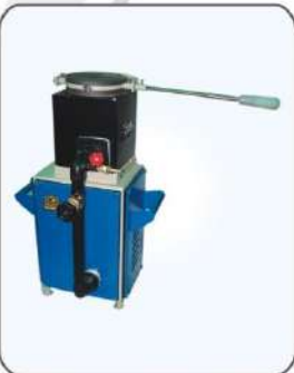
25.1801 to 25.1806 Melting Furnace Air & Gas Fueled Table Top Model 1 Kg. to 10 Kg. Models