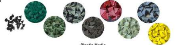
Plastic Media ▲ Cone ▲ Triangle ▲ Cylindrica Wedges ▲ Pyramids ▲ Wedges ▲ Tetrahedrons