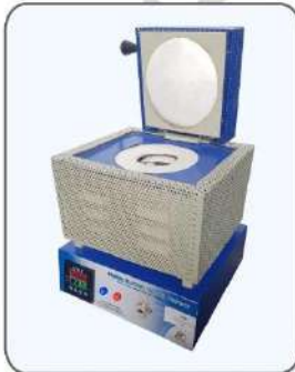
25.1677 to 25.1689 Melting Furnace with Silicon Carbide Heating Element (Quick Melting) 1 Kg. to 100 Kg. Gold Capacity