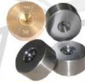
80.1102 Wire Drawing Dies - Available with Diamond or Carbide Dies - Available in SS or Brass Body