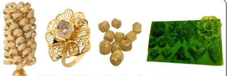
Special Light Weight Casting Jewellery Factory Setup