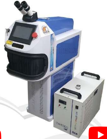
48.1223 Eagle Laser Welding Machine - Available 230W