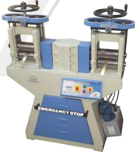
64.5779, 64.5786, 64.5789 Double Head Big Size Heavy Duty Rolling Mill Premium Model - Available Roller Size 6" x 4", 8" x 4" and 8" x 5"