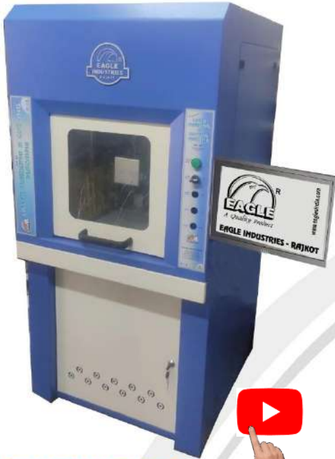
48.4110, 48.4106, 48.4105 Eagle Laser Cutting & Marking Machine - Available 100W, 60W and 50W Models