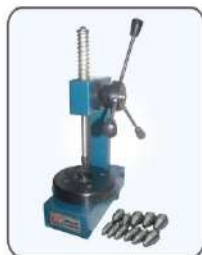
16.1601 Ring Rounding Machine with 12 Dies