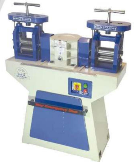
64.5706, 64.5716, 64.5726 Double Head Rolling Mill Standard Model - Available Roller Sizes 4" x 2.25", 5" x 2.5" and 6" x 3"