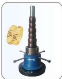
16.1236 Bangle Expanding Machine 24 strips (Premium) Outer half Round Shape