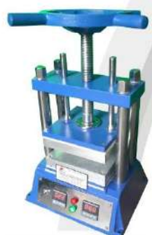
25.0121 to 25.0123 Digital Vulcanizer (Die Press) - Available 3 Platform Sizes