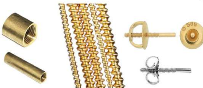
Threading Factory Setup (South and North Type) (For making threaded / rolled pins for Earrings and For Making Threads in Earrings' Butterflies)