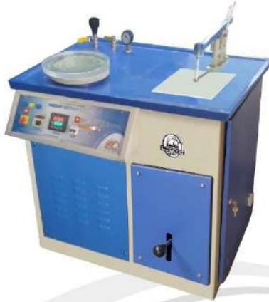
25.0531, 25.0532, 25.0533