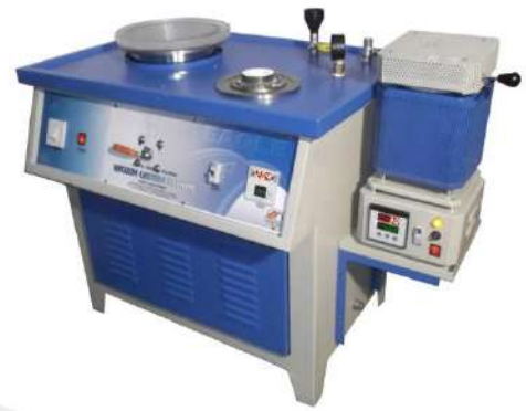
25.0506, 25.0507, 25.0509