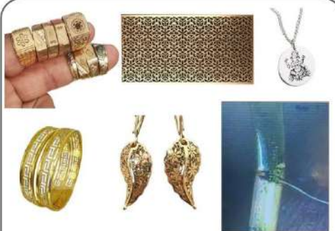
Laser Cutting / Welding / Marking Full Setup for Jewellery Factory