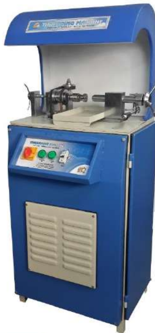
80.6151 Threading Machine - For making Tube Earring Post