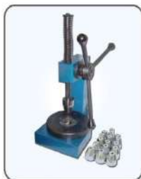
16.1501 Bangle Rounding Machine with 17 Dies