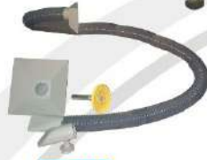
59.0158 Inside Outside Floor Dust Collection Accessories