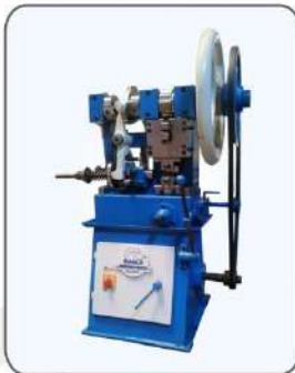
54.0501 Ball Making Machine for Making Balls from Soldered Pipes Available Full Setup for Ball Making