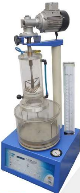
25.0591 Investment Powder Mixer with Automatic Flask Filling System - Vacuum System - Available Standard and Customized Models