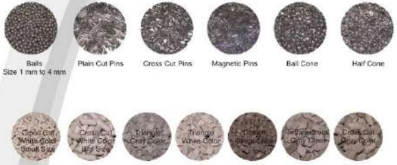
Ceramic Media ▲ Cone ▲ Triangle ▲ Cylindrica Wedges ▲ Pyramids ▲ Wedges ▲ Tetrahedrons

26.2101, 2106 & 2107 Vibrator Polisher Shampoo (Regular, Super Shine & Deburring)