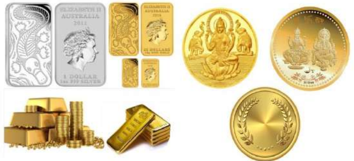
Gold & Silver Coin Minting Factory Setup (Full Setup from Melting to Coin Packing)