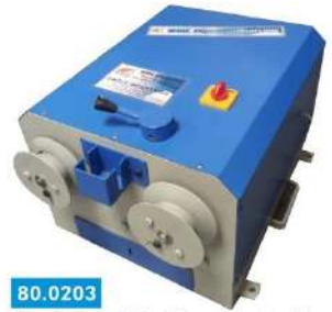
80.0203 Single Pass Wire Drawing Machine - With Reverse & Forward