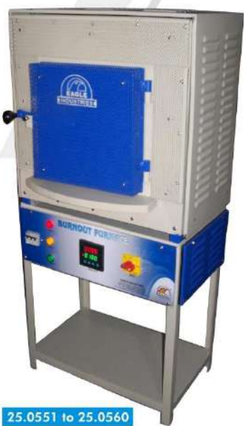
25.0551 to 25.0560 Burnout Furnace Digital with Programmable Step Timer - Optional Wax Elimination Tray - Optional Air Circulation System