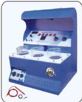
57.0302 and 57.0304 Four in One Rhodium Plating Plant With Magnetic Stirrer System 1 Liter and 2 Liter Models