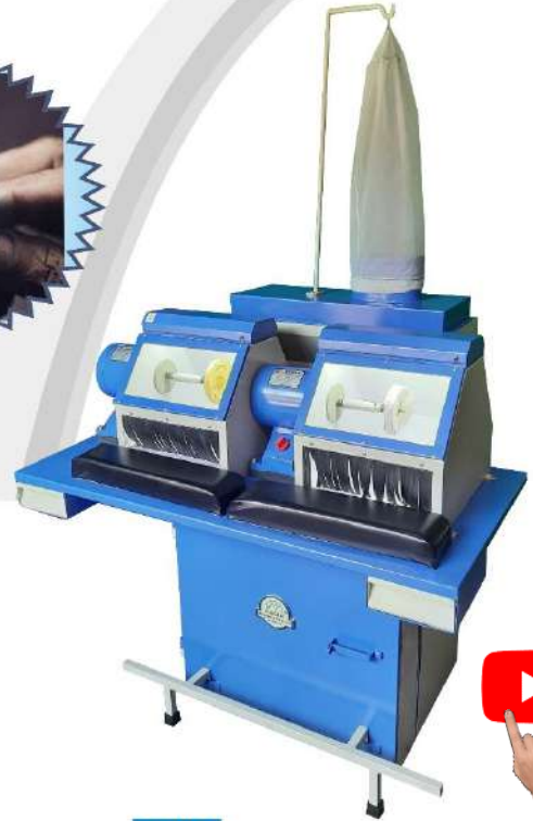
59.0126 Eagle Premium Polishing System with Dust Collector - 4 Filter System - Double Motor - Double Station (Double Hood)