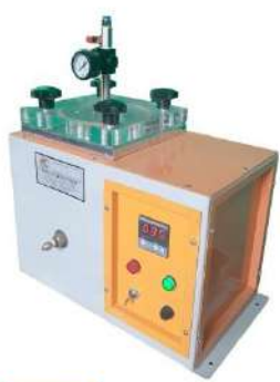
25.0202 Digital Wax Injector