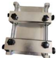
48.4721 Vise for Laser Marking & Cutting