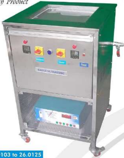
26.0103 to 26.0125