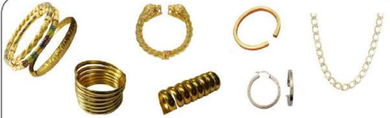
Hollow Bangles / Rings / Earring Factory Setup