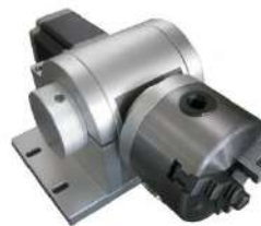
48.4518 and 48.4520 Rotary Laser Marking Attachment - Available Small and Big 2 Sizes