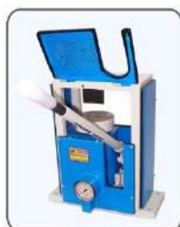
16.0601 Hydraulic Biscuit Cutter cum Bangle Design Die Press