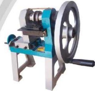
16.0102 Manual Strip Cutter Machine