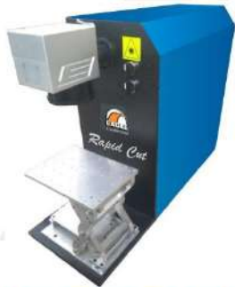
48.5102, 48.5103, 48.5105 Eagle Compact Table Top Laser Marking Machine - Available 20W, 30W, 50W - 50W can do laser cutting work