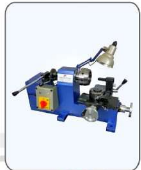
16.0701 Bangle & Ring Inside Outside Turning Machine