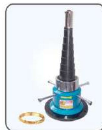
16.1231 Bangle Expanding Machine 24 strips (STANDARD)