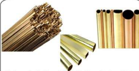
Automatic Soldered Pipe Making Factory Setup