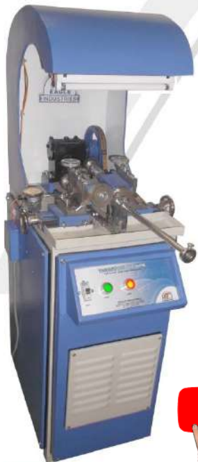
80.6107 Threading Machine for Continuous Deep Thread - For making Earring Pins