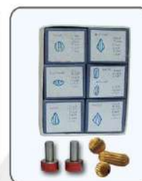
64.7101, 64.7120 & 64.7121 Corrugated Pearl Shape Dies Available With & Without Tempering