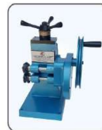
16.1311 Bangle & Ring Grooving Machine Premium Model