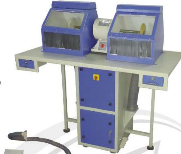
59.0111 Double Station Single Motor Polishing System with Dust Collector - With Double Filter System