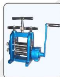
64.5403 Rolling Mill Hand Powered Italian Type With Gear Box Available Size 5"