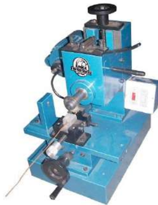
16.0507 Tube/Hollow Pipe Cutter Machine - For Straight Pipe Cutting - Dust Collection Box (Optional)