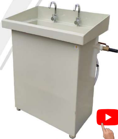
26.0611 to 26.0613