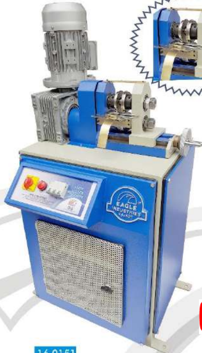
16.0151 Electric Strip Cutter Machine - Available With or Without Speed Controller