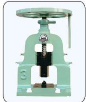
60.0123, 60.0126, 60.0129 Flywheel Hand Press Double Body Available 3 No. / 6 No. / 10 No.