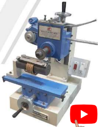
16.0503 Tube/Hollow Pipe Cutter Machine - For Coil Cutting - Dust Collection Box (Optional)