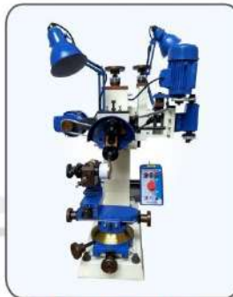
31.0561 and 31.0566 Double Head Faceting & Milling Machine for Diamond Cut Available Standard & Zig Zag Models