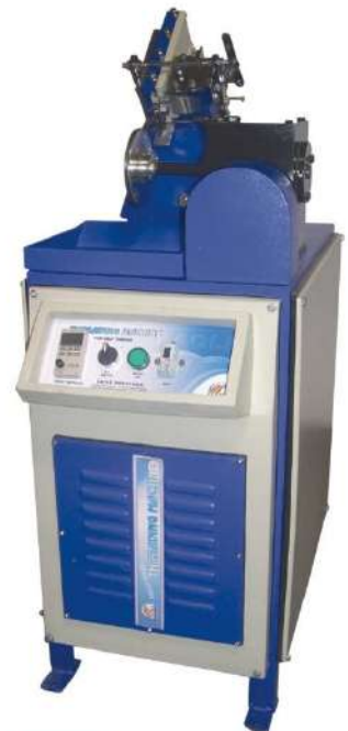
80.6106 Threading Machine for Cut Piece Thread - For Half & Deep Threading on Earring Post