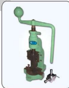
60.0150 to 60.0179 Die Cutting Hand Press Available with Handle or Fly Wheel Available 1 No. to 9 No. Models