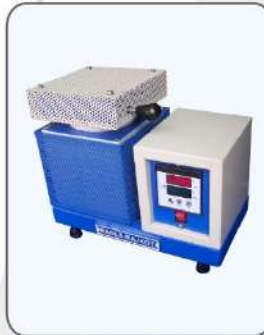
25.1631 to 25.1637 Melting Furnace Standard Digital Model 500 Gms. to 10 Kg. Gold Capacity