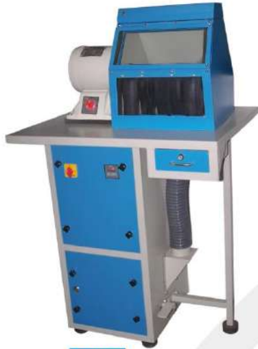
59.0101 Single Station Polishing System with Dust Collector - Double Filter System