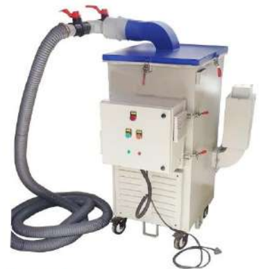
48.4511 Additional Fume Extractor (Dust Collector) For Laser Cutting & Marking Machine