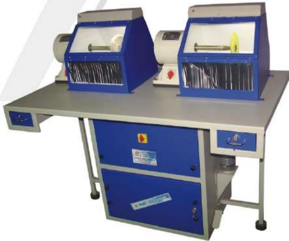
59.0121 Double Station Double Motor Polishing System with Dust Collector - With Double Filter System