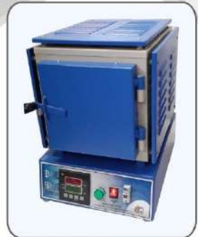
40.0211 Enamel Melting Furnace Digital Model