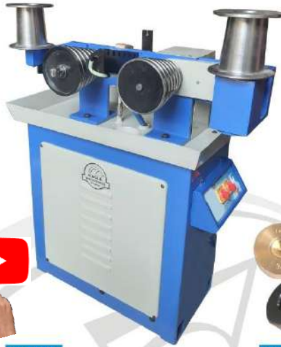
80.0301 6 Pass Wire Drawing Machine (Optional Speed Controller AC Drive)