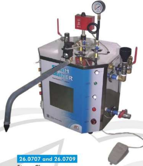
26.0707 and 26.0709