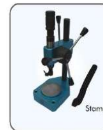
70.0101 & 70.0151 Stamping Machine Also Available Heavy Model