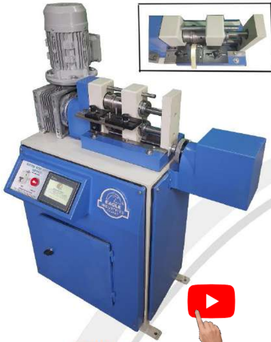
16.0181 Electric Strip Cutter Machine - With HMI Drive Easy Set System