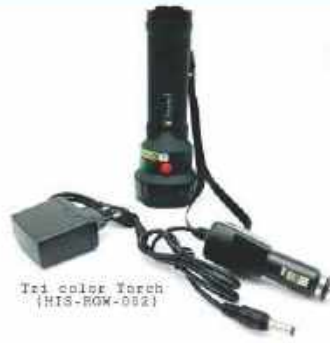
Tri color Torch (HIS-RGW-002)