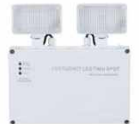
WATERPROOF EMERGENCY EXIT LIGHT