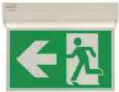
ACRYLIC EXIT LIGHT