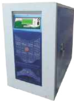
UTL 3 PHASE ONLINE UPS MARS ONLINE UPS 6 kVA to 40 kVA