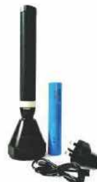
ELEPHANT 3500M TORCH