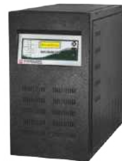
UTL SINGLE PHASE UPS ALFA Online UPS 3 kVA to 10 kVA