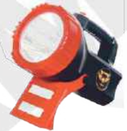
35W DIAMOND TORCH