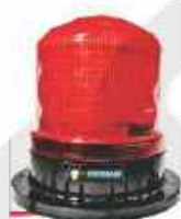
(9-110V DC) HIS-FLWS-014AV