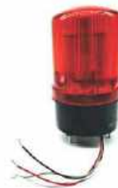
(12V DC/24V DC/ 110V AC/ 220 VAC) HIS-FLWS-014M