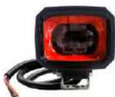
RED ZONE 017