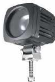
BLINKING ARROW 003F