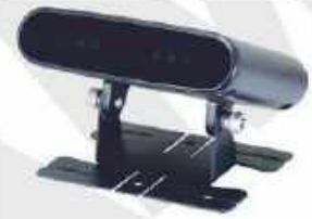
DRIVER FATIGUE MONITOR SYSTEM