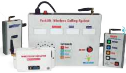
FORKLIFT WIRELESS REMOTE CALLING SYSTEM (HIS-FLWS-035)