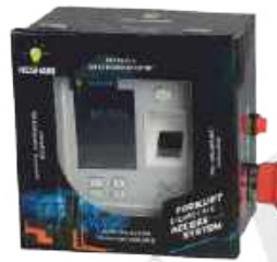
FORKLIFT BIOMETRIC ACCESS SYSTEM