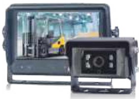
HD WATERPROOF REAR VIEW CAMERA SYSTEM