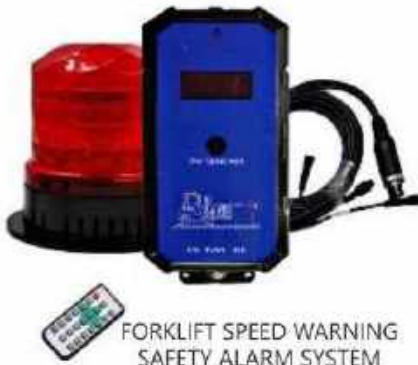
FORKLIFT SPEED WARNING SAFETY ALARM SYSTEM