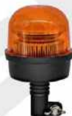
(10-32V DC) HIS-FLWS-014PM-1M