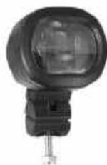
RED ZONE 016