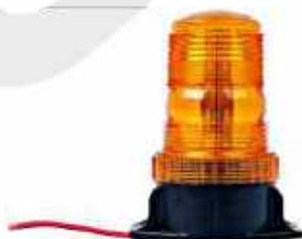
15W (10-110V DC) HIS-FLWS-014S