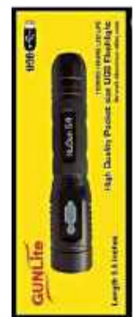
GUNLITE METAL TORCHES