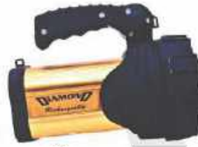
15W DIAMOND TORCH