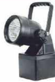
LED EXPLOSION PROOF RECHARGEABLE WORK LIGHT