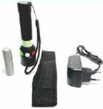
HIS-RGW-001 TRI COLOR TORCH