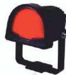
FORKLIFT ARC LIGHT