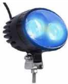
BLUE SPOT 002