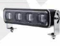
RED ZONE 006B