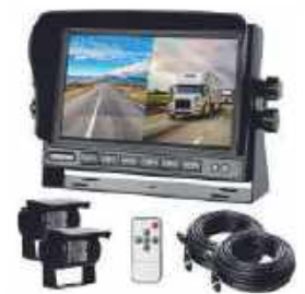
NEW FORKLIFT AHD/HD CAMERA SYSTEM