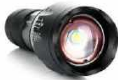
10W MINI DIAMOND TORCH