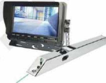
HESHAM FORKLIFT WIRED FORK VIEW CAMERA SYSTEM WITH LASER LIGHT