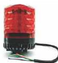
(9-30V DC) HIS-FLWS-014R