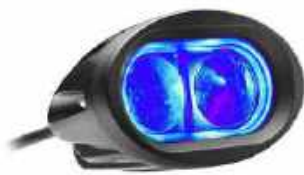
BLUE SPOT 001