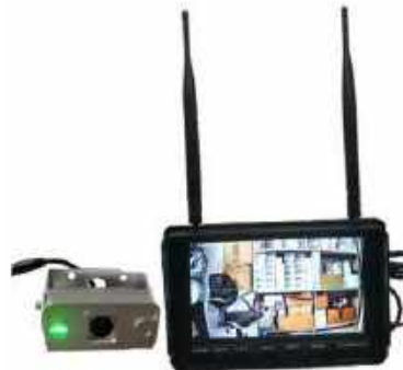
FORKLIFT CAMERA WITH LÉGER (HIS-FLWS-024CM-L)