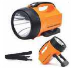
EXPLOSION PROOF LED RECHARGEABLE SEARCH LIGHT