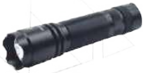
EXPLOSION-PROOF RECHARGEABLE FLASHLIGHTS