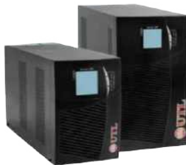
DEEP IMPACT High Frequency Based