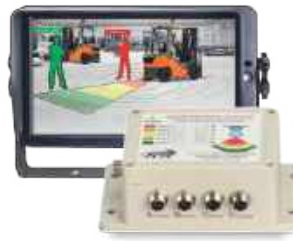
FORKLIFT ANTI COLISION SYSTEM