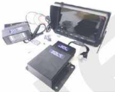
CARRIAGE MOUNTED WIRELESS CAMERA SYSTEM