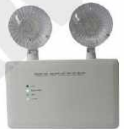
TWINSLOT 6W EMERGENCY EXIT LIGHT(HIS-EES-003)