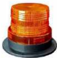
15W (10-110V DC) HIS-FLWS-014