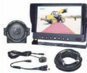
AI PEDESTRIAN WARNING REAR VIEW SYSTEM