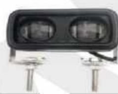
RED ZONE 006