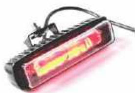
RED ZONE 013