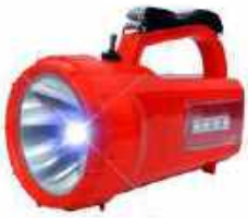
DIAMOND 5 WATT LED TORCH