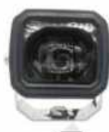
RED ZONE 017s