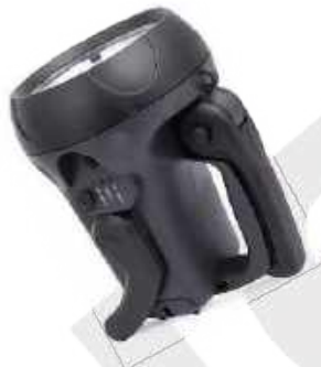
DRAGON SEARCH LIGHT