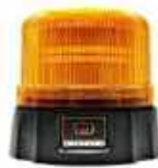
(5V DC) HIS-FLWS-014MS