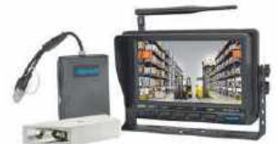
FORKLIFT WIRELESS HD CAMERA SYSTEM