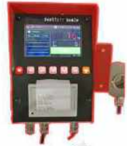
FORKLIFT WEIGHT MONITORING