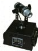
80 WATTS MOVING HEAD BEAM LASER