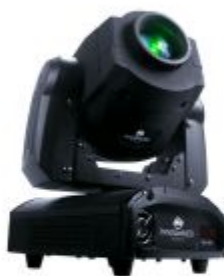
S206 50W LED GOBO MOVING HEAD