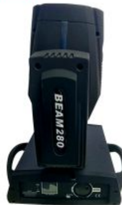
YODN Lamp High Speed Super Bright Touch Screen Glass Gobos 8/16/24 Prism