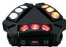
S201 9 x 12W (4 IN 1) LED 3 MOVING HEAD SPIDER LIGHT