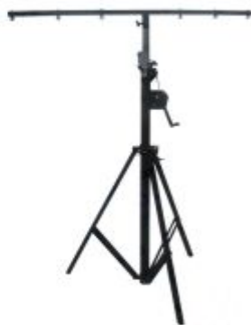
MS WINCH STAND HEAVY WITH DOUBLE "T" (12 FEET)