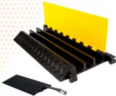
CABLE RAMP/ CABLE RUBBER MAT