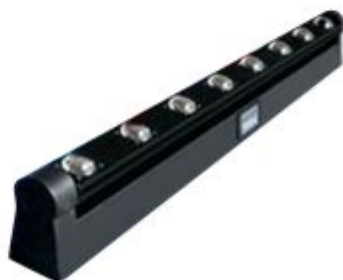
8 LENS RGBW RAFTOR LIGHT