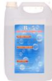
BUBBLE LIQUID 5 LTRS/ SNOW LIQUID 5 LTRS