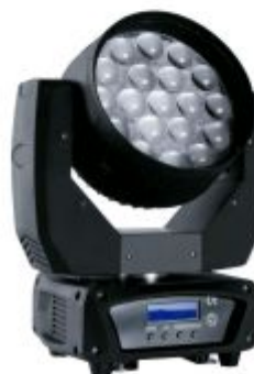
12 x 19 LED MOVING HEAD WASH WITH ZOOM