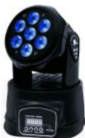
S205 7PCS x 12W (4 in 1) LED MOVING HEAD