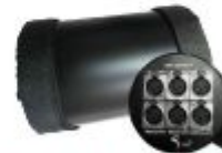
6 CH DMX ROUND SPLITTER