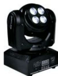
S207 4 x 12 W (6in1) LED MOVING HEAD WITH REMOTE