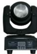
S203 30W(4 IN 1) LED BEAM MOVING HEAD