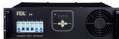
FDL DIMMER PACK 6KWA x 6CH