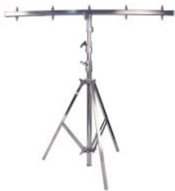
STAINLESS STEEL STAND (12FEET)