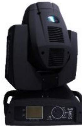
High Speed Super Bright Touch Screen Glass Gobos 8/16/24 Prism