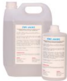
FOG JUICE 1/5 LTR