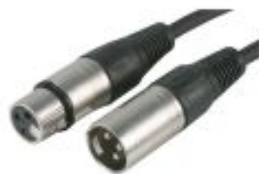
XLR M/F PAIR