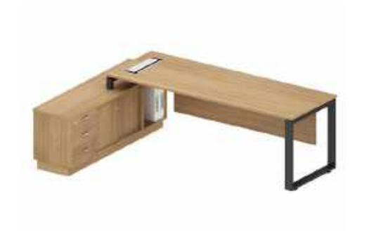
Royal M Series