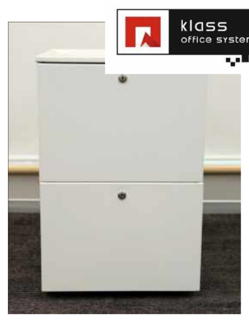
W Manual Drawer Systems Evernova Series