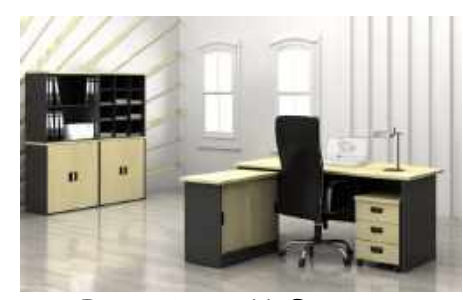
Premium M Series