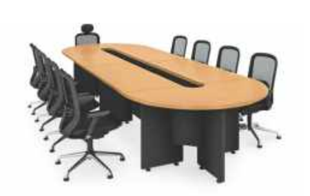
Vega Series - Principal conference Table