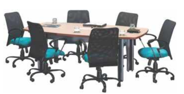
Vega Series - Oval Type conference Table