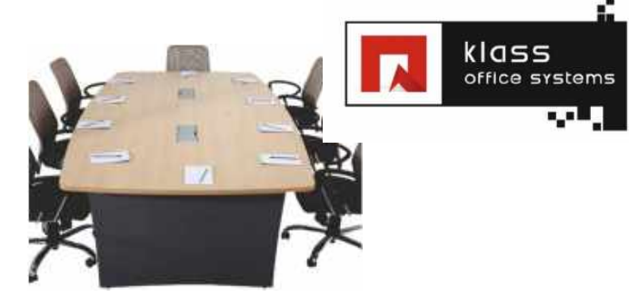
Vega Series - Vertex conference Table