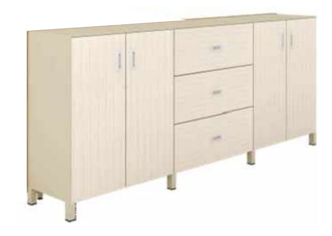
Standard Storage Systems - Evernova One Series