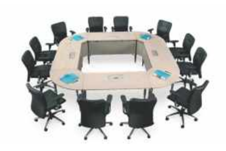
Vega Series - O type conference Table