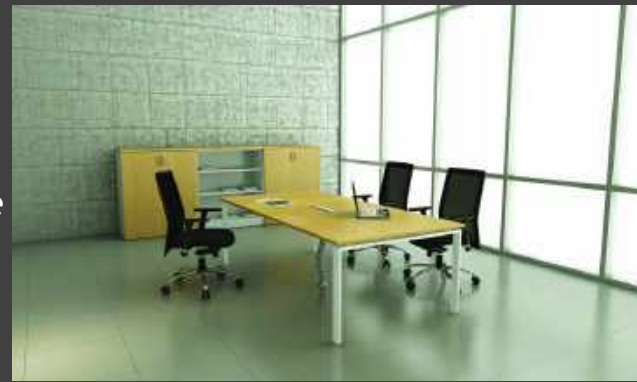
CONFERENCE & MEETING Table - Vega SERIES