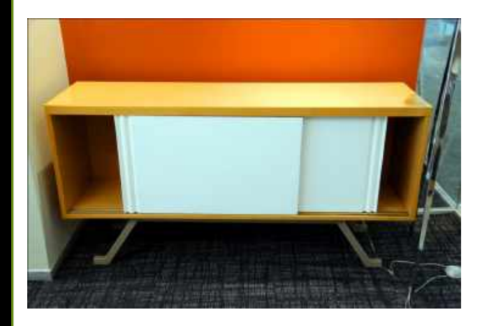
Free Standing L.H. Sliding Unit - Evernova Series