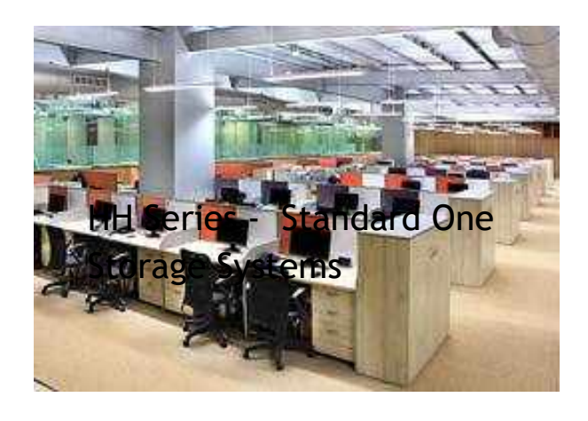
Standard Storage Systems - Evernova Series