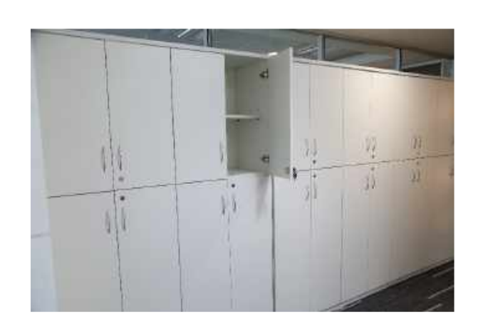
W Full Ht Standard Storage Systems - Evernova Series