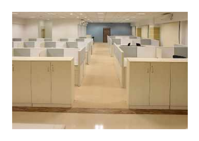
Standard Storage Systems - Evernova Series