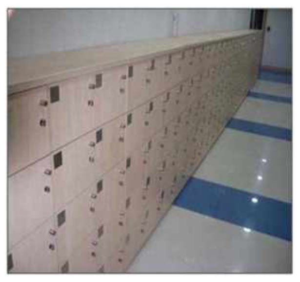
W Manual Locker Systems - Evernova Series