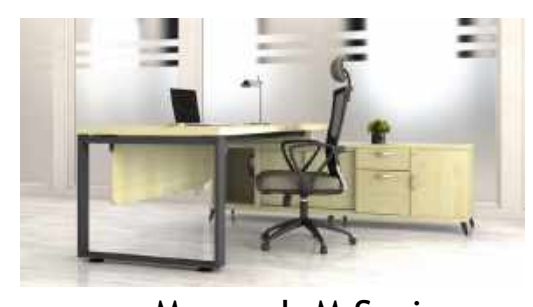
Monarch M Series