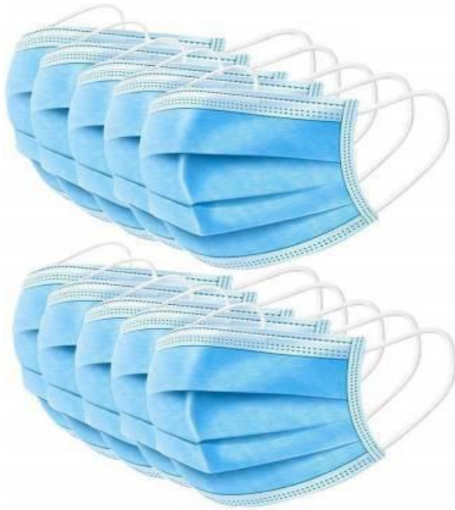
Disposable air filter face mask 3 ply layer surgical ear loop nose clip