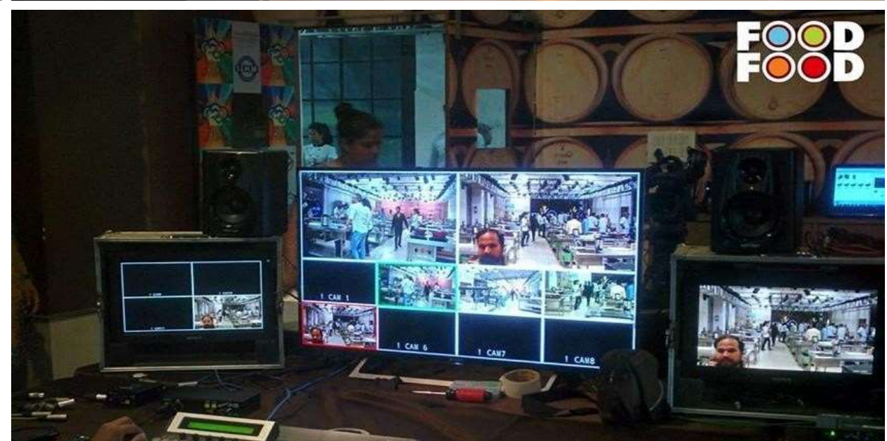
TRUSSING & LIGHTING for the shoot of Young Chef India Schools televised on Food Food channel.