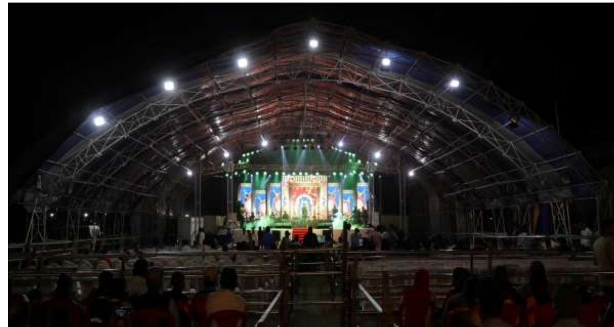
SOUND, TRUSSING, LIGHTS, LED with CONTENT MAPPING for NALWARI MELA 2018 Bilaspur, Himachal Pradesh.