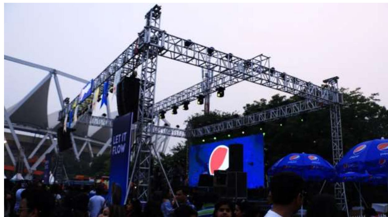
TECHNICAL PRODUCTIONS for Sunburn – BollyBoom featuring Guru Randhawa at Chancellor Club, Lucknow.