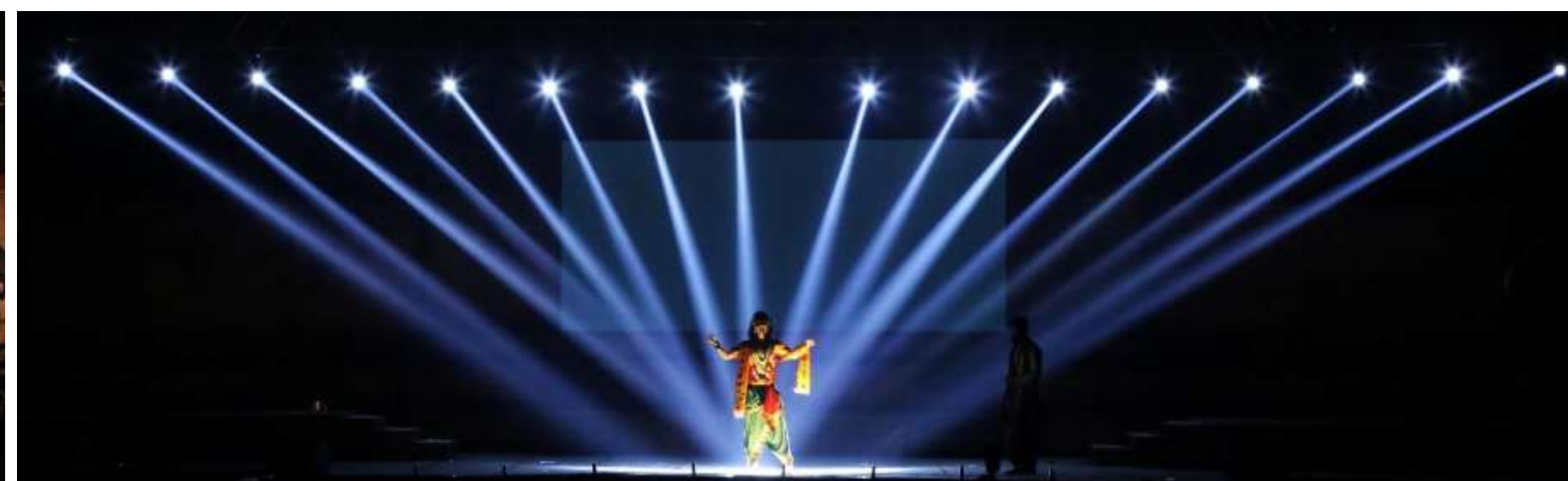
COMPLETE STAGE PRODUCTIONS for a dance drama play themed Bhishma Pitamah held at a School in Ghaziabad.