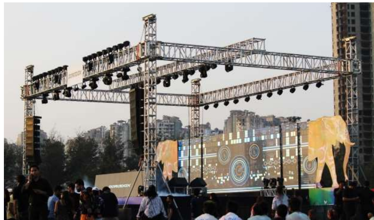
SOUND, TRUSSING, LIGHTS, LED with CONTENT for Rang Manch – Holi Bash Fest held at Unitech Golf Club, Noida.