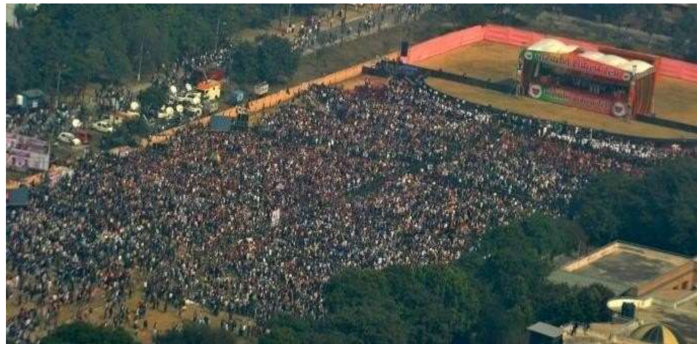
STAGE CRAFT & TRUSSING work for PM Modi's Parivartan Sankalp Rally in Ghaziabad on 8 February 2017.