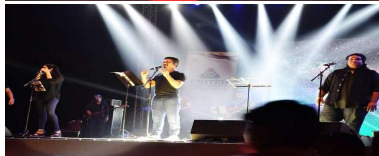
TECHNICAL PRODUCTIONS for AMIT TRIVEDI Live at a college fest in Prayagraj, Uttar Pradesh .