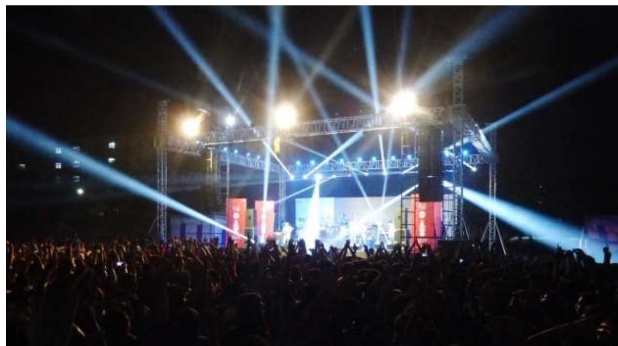
TECHNICAL PRODUCTIONS for Coke Studio Night featuring Euphoria at SRM University college fest in NCR .