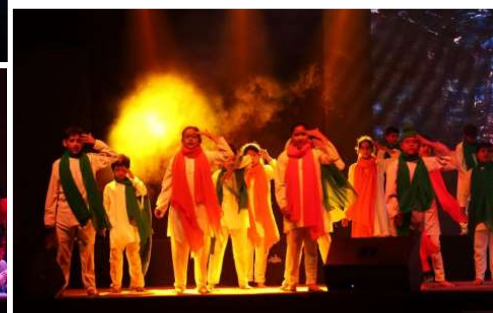
COMPLETE STAGE PRODUCTIONS for a theatre show on the life of Bhagat Singh held at a School in Noida.