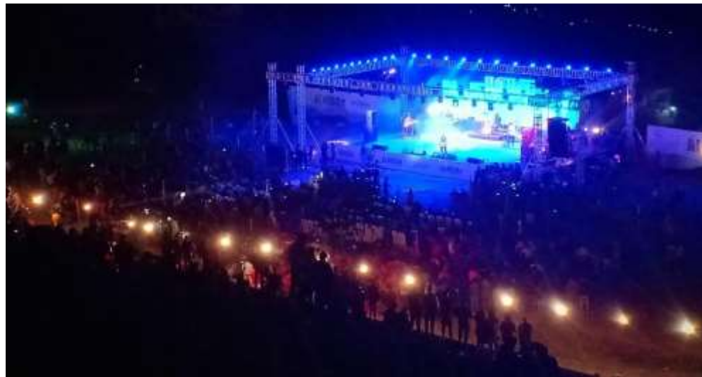
SOUND, TRUSSING, LIGHTS, LED with CONTENT MAPPING for ALMORA FESTIVAL 2018 , Almora, Uttrakhand.