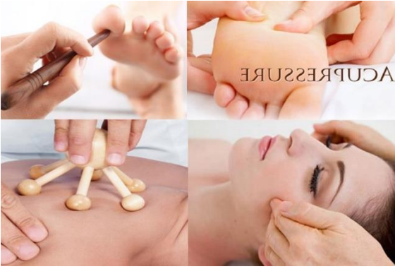
Ancient-Acupressure & Reflexology