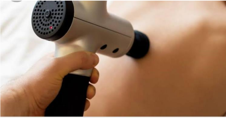
Deep Tissue-Gun Massager