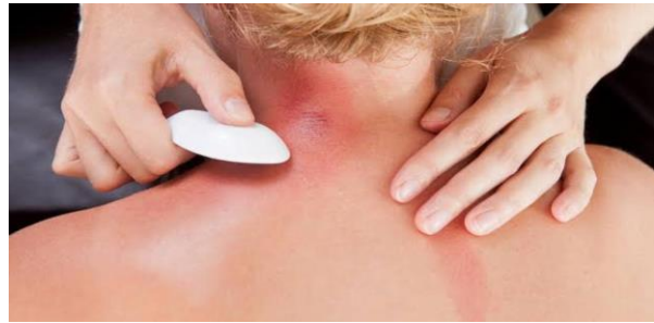
Deep Gua-Sha Massage