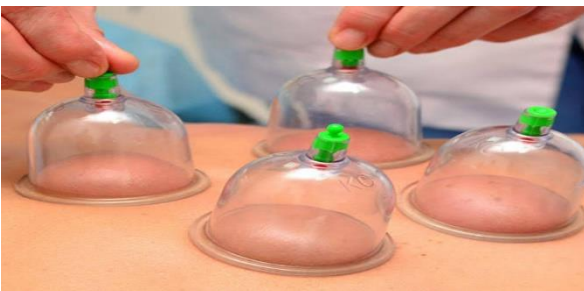
Dry Cupping-Suction Tissues