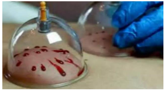
Wet Cupping- Detoxification