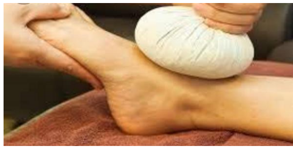
Herb-Heat Potli Compression