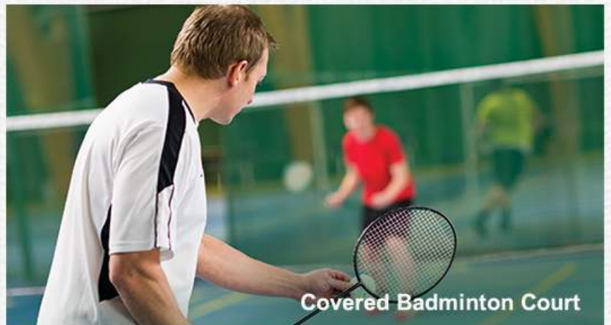
Covered Badminton Court