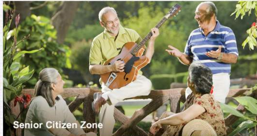
Senior Citizen Zone