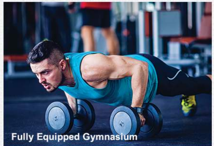
Fully Equipped Gymnasium