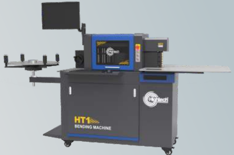
Channel Bending Machine