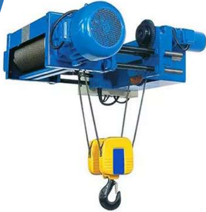
WIRE ROPE HOIST