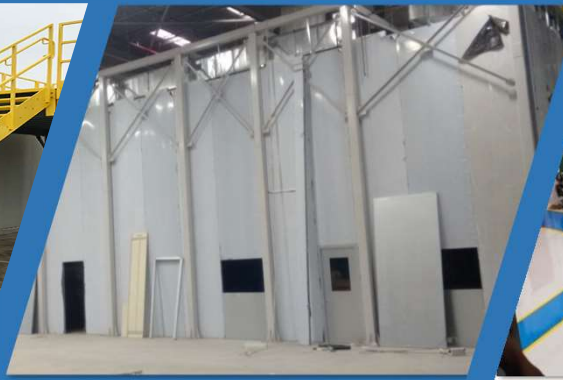
PUF PANEL PARTITION