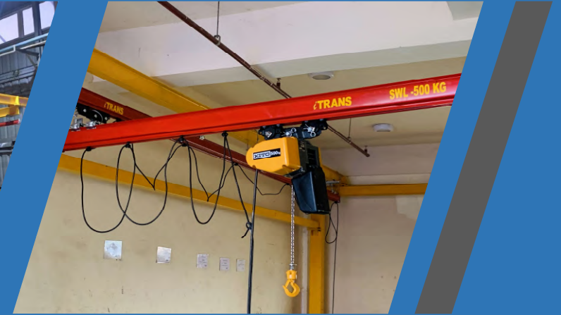
KBK RAIL SYSTEM