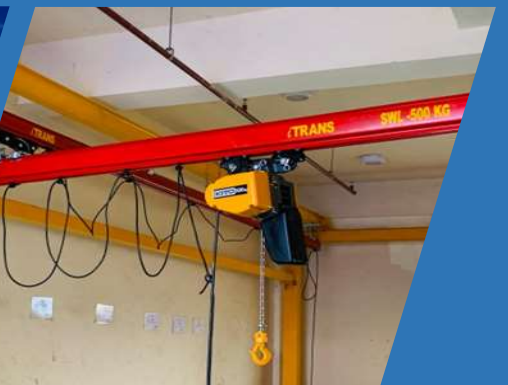
KBK RAIL SYSTEM