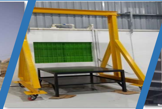
A TYPE CRANE