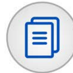
Paper & Pulp