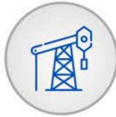
Metals & Mining