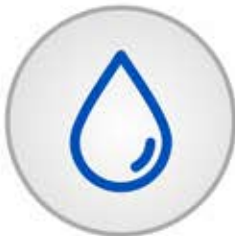
Water & Wastewater