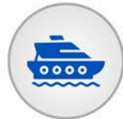
Marine & Ship Building