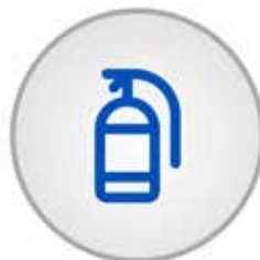
HVAC & Fire Fighting