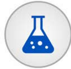
Chemicals & Petrochemicals