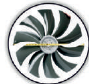
Power Full Blade