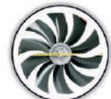
Power Full Blade