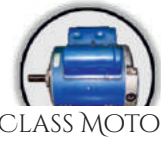
A CLASS MOTOR