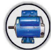
A CLASS MOTOR