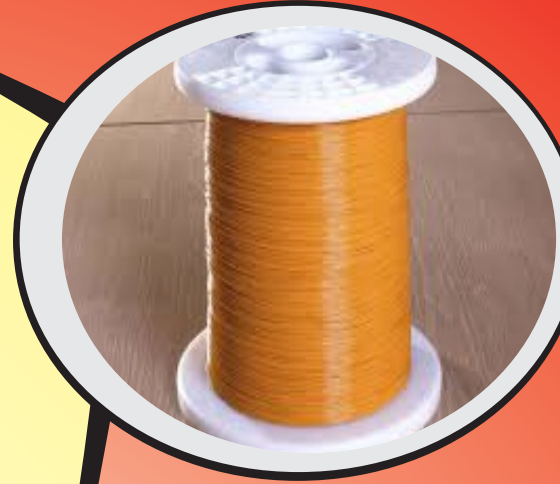
TRIPPLE INSULATED WIRE (TIW)