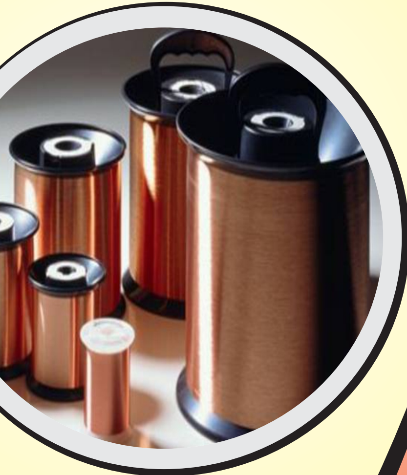
SELF SOLDERABLE ENAMELLED COPPER WIRES

LEADING PRODUCER OF FINE & ULTRA FINE ENAMELED COPPER WIRES (UL APPROVED)