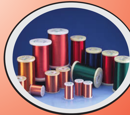
FIW (Fully Insulated Wire)