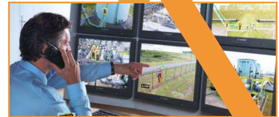
Electronic Security HI-Tech Gadgets, Cameras & Services