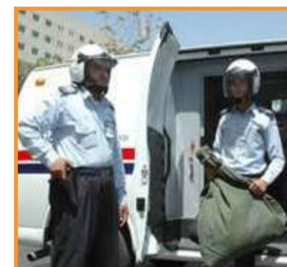
Cash Management Services