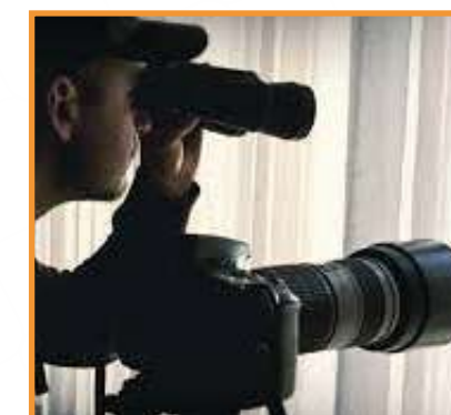
Personal & Financial Investigation