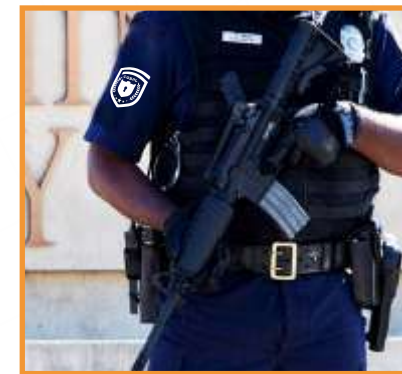
Armed & Unarmed Guarding